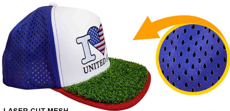
LASER CUT MESH