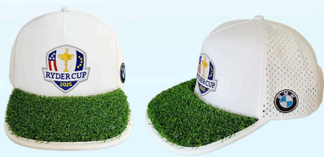
Embroidery Front & Side