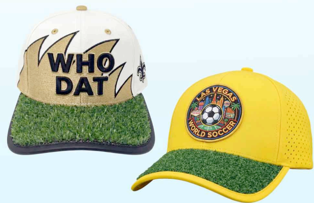
Direct to Garment Print or Printed/Embossed Patch