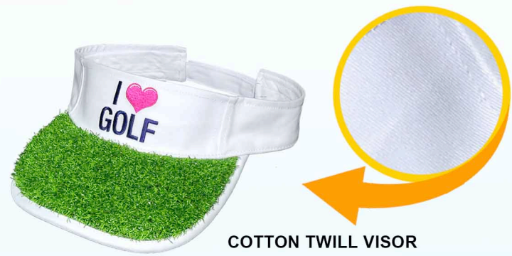
COTTON TWILL VISOR